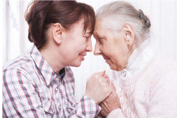
Caring for a loved one can be demanding and stressful.

Providing care to a loved one is rewarding. But it can also be hard work and emotionally taxing. If you're a primary caregiver to a family member or friend, UWAAA's Alabama Cares program may be able to help you answer the challenge. Once a month, people in similar situations meet at our Caregiver Support Group and talk about problems, share solutions and offer each other encouragement. Click here for more information or call 1-800-AGE-LINE (1-800-243-5463) for meeting details, and join us in a supportive, confidential setting at United Way of Central Alabama.