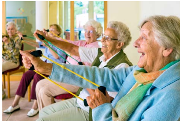
It's fun to stay active as a member of a Senior Center.

Seniors in Jefferson County have many wonderful resources, including more than 30 community-based Senior Centers, for all kinds of active engagement. UWAAA's Senior Nutrition Program provides weekday lunches at each center, creating great opportunities for socializing as well as enjoying a healthy meal. In addition, our Senior Centers offer a wide range of activities and learning