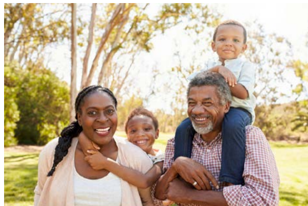
This support group can make a labor of love a little easier.

Raising grandchildren can also raise a number of issues for older adults. But UWAAA's Alabama Cares program offers a Grandparents Raising Grandchildren Support Group, which meets once a month to openly discuss the demands of the job, ways to effectively fulfill your responsibilities and techniques to help you cope. Meetings are held in a welcoming, supportive,